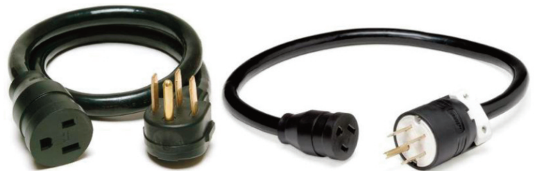
S21 Plug to 1252 Receptacle, 4 ft. 9451C Plug to 1252 Receptacle, 3 ft.