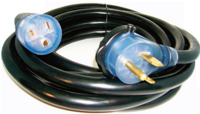
8/3 Heavy Duty Lighted Welding Machine Cords: 25 and 50 ft. Lengths (6-50P to 6-50R)