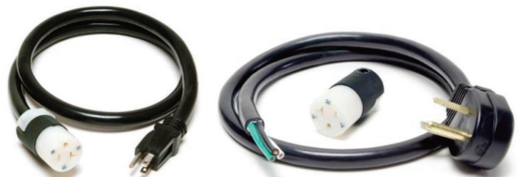
15A Plug to 20A Receptacle, 4 ft.